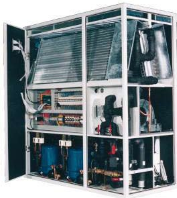
EDA.F 415 D